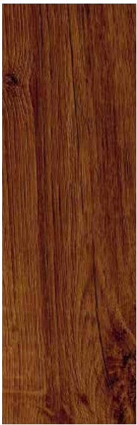
Benin Oak 24572