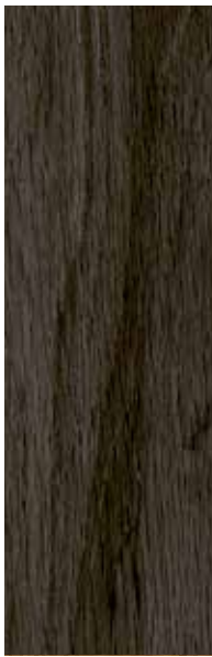
Opazo Oak 24983