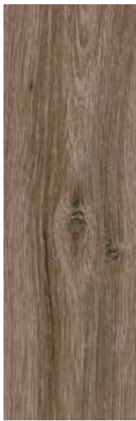
Huxley Oak 24867