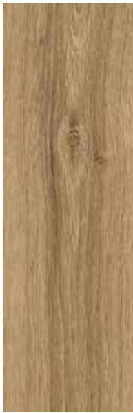
Fogo Oak 24244