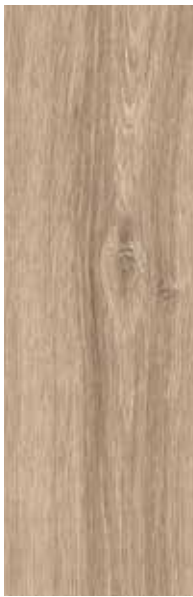
Avri Oak 24219