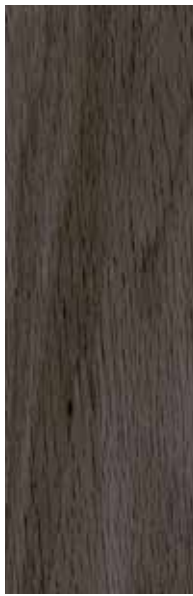
Zain Oak 24890