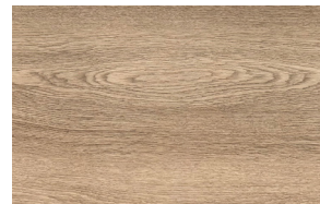
Berkshire Oak GENST90216