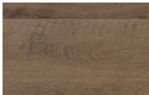
Hatfield Oak GENST8024