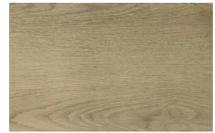
Oxford Oak GENST22066817