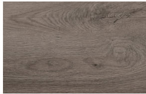
Glenmore Oak GENST4873