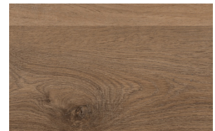
Kinross Oak GENST48712