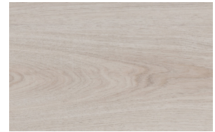
Odell Oak GENST612219