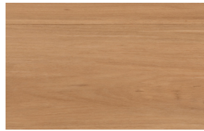
Redhill Blackbutt GENST13502