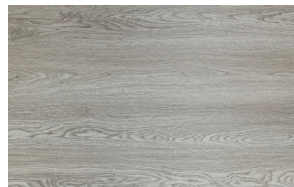
Norfolk Oak GENST90213