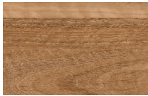
Waterford Spotted Gum GENST14901