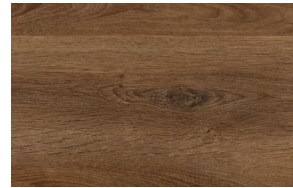
Carrick Oak GENST61221