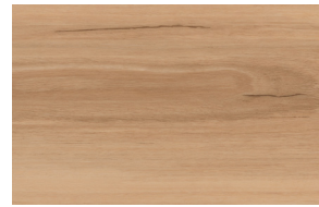
Foxley Blackbutt GENST13501