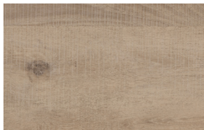
Cornwall Oak GENST8026