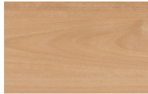
Thorpe Spotted Gum GENST15006