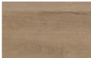
Dorset Oak GENST8028