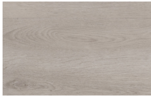
Ashridge Oak GENST4876