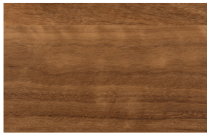
Kilkenny Spotted Gum GENST14906