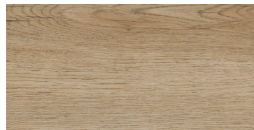
VERDANT SPRINGS FORESTVIEW080