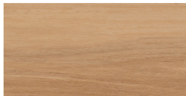
MAPLE MEADOW FORESTVIEW070