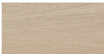
FERN TRAIL FORESTVIEW030