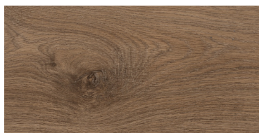
SPRUCE CREEK FORESTVIEW090