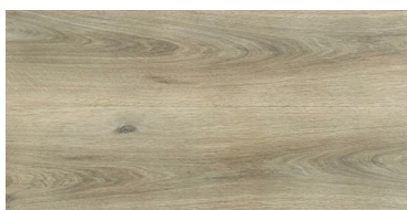
RIVER BEND FORESTVIEW020