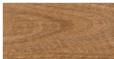
CONIFER PASS FORESTVIEW040