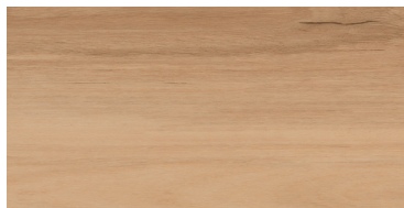
LAKE CRESCENT FORESTVIEW060