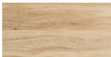
MOSS GROVE FORESTVIEW010