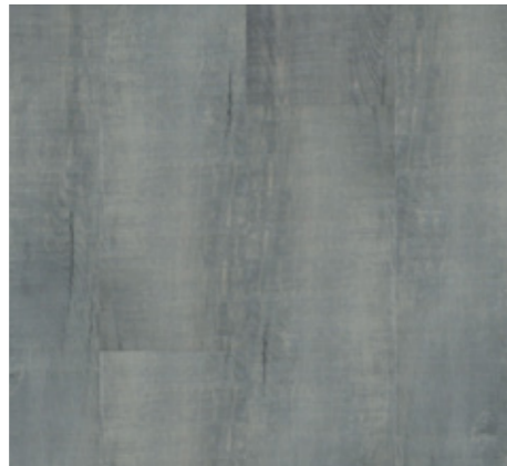
Earl Oak EMP123812TC