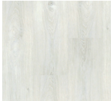
Ice Oak EMP1313110TC