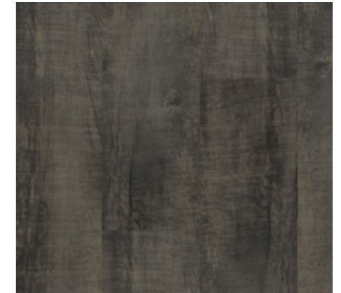
Tiger Oak EMP123815TC *