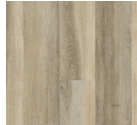
Swiss Oak EMP642109TC * WOODMIX