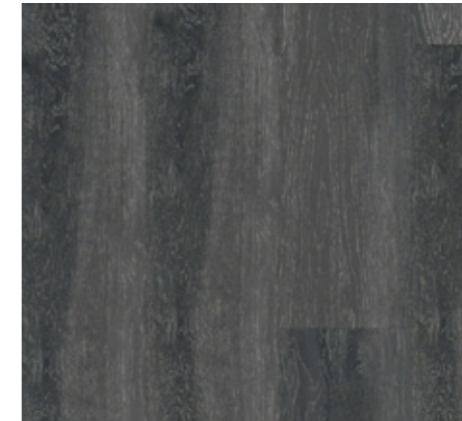
Ebony Oak EMP642112TC * WOODMIX