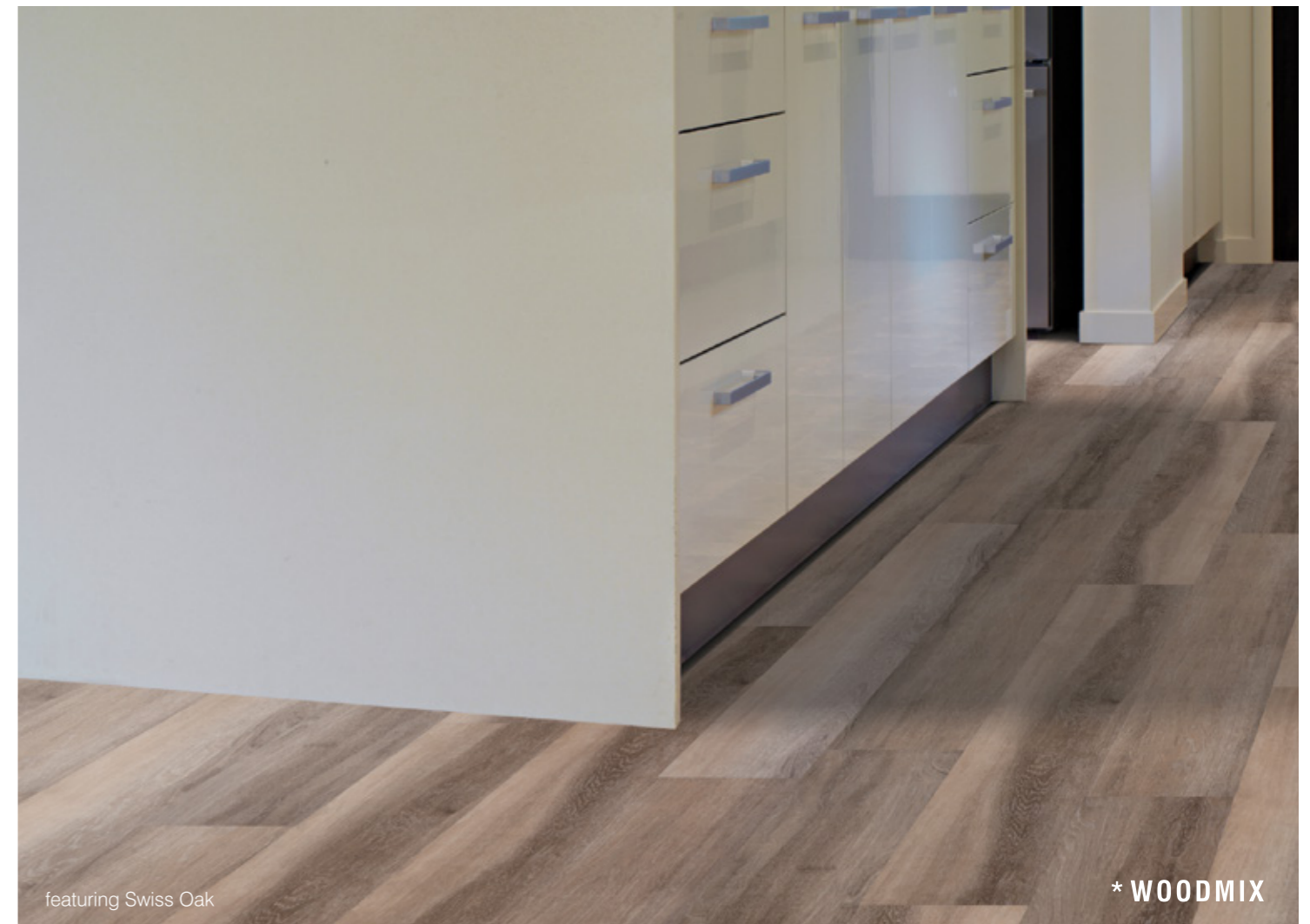
featuring Swiss Oak

Empire XL is backed by: 20 Year Residential Guarantee 10 Year Light Commercial Guarantee