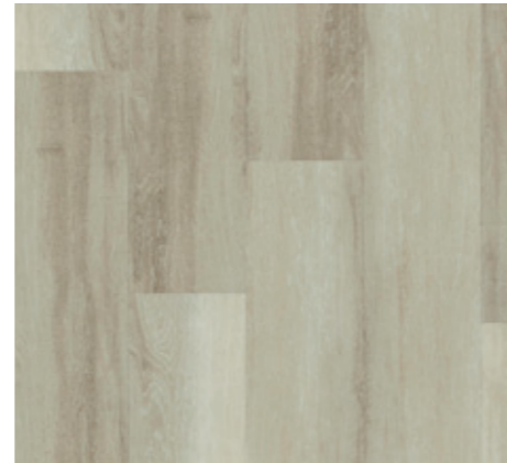
Breeze Oak EMP642107TC * WOODMIX