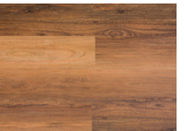
Mountain Ash Spotted Gum* CAS76813 Stringybark Spotted Gum* CAS76802