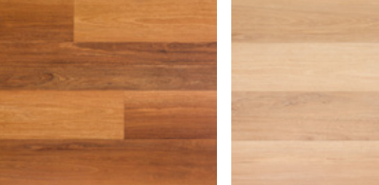
Coolabah Spotted Gum* CAS76804