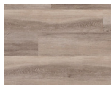
Swiss Oak* CAS642109