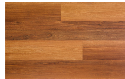
Coolabah Spotted Gum ARN76804 *WOODMIX