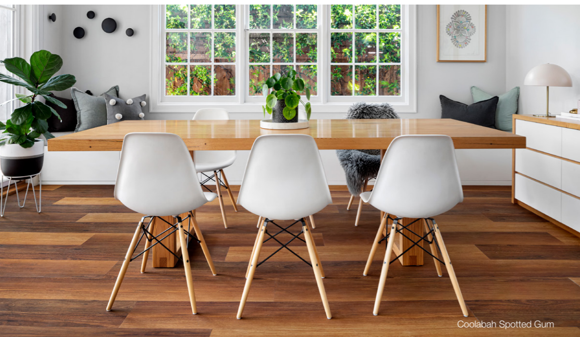
Coolabah Spotted Gum

Signature Floors® MicroGard® is an excellent antibacterial and antifungal treatment making polymers resistant to microbial growth.