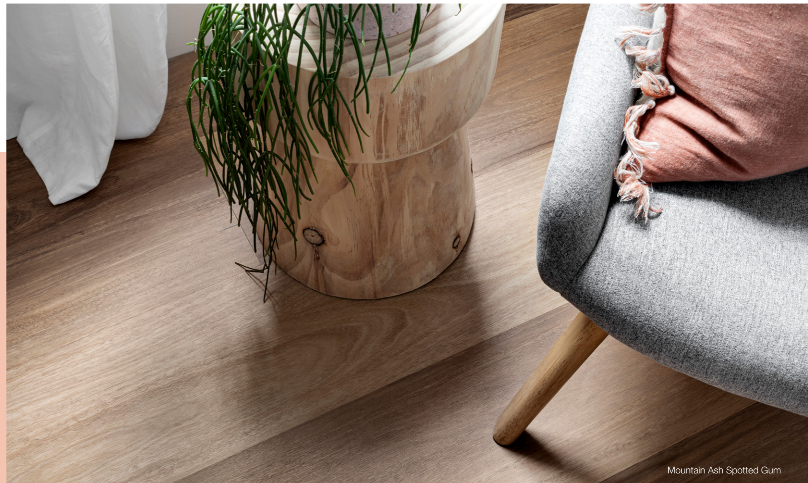
Mountain Ash Spotted Gum