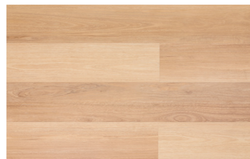
Manna Gum ARN76812 *WOODMIX