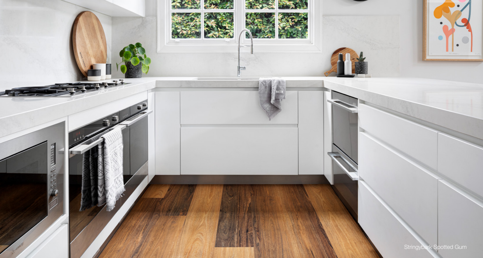
Stringybark Spotted Gum