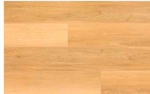
Mountain Ash Spotted Gum ARN76813 *WOODMIX