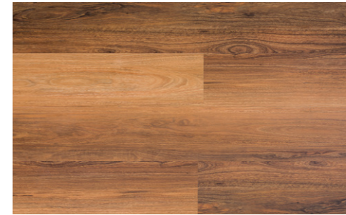
Stringybark Spotted Gum ARN76802 *WOODMIX