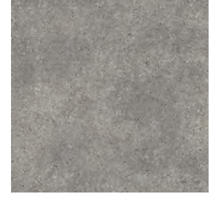
puno VST11820594 Pattern Repeat L100 x W100 Drop 1/2 Reverse Lay