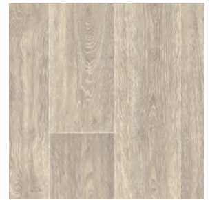
chaparral oak VST19320509 Pattern Repeat L100 x W99.5 Drop 1/2