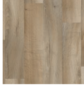
burgos V7718731 Pattern Repeat L100 x W99.5 Drop 2/5