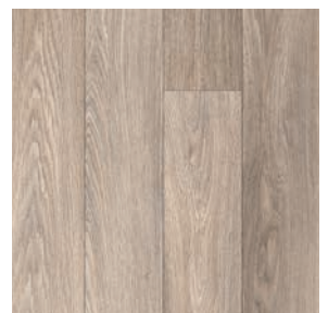
nimes V10918593 Pattern Repeat L100 x W99.5 Drop 1