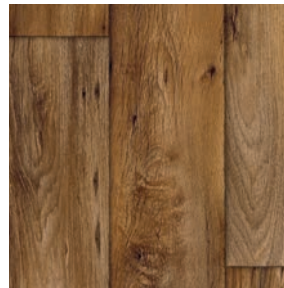
rustic oak V5418745 Pattern Repeat L100 x W100 Drop 2/5