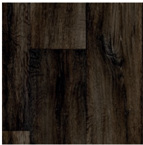
tundra V20118549 Pattern Repeat L120 x W99.5 Drop 5/6