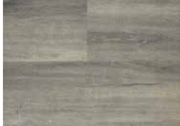
Kings Oak SUM4911SP