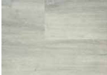
Paronella Oak SUM4912SP

WATER PROOF FAMILY PROOF FADE RESISTANT HEAT RESISTANT