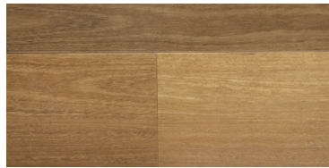
Yengo Spotted Gum RET010 *WOODMIX