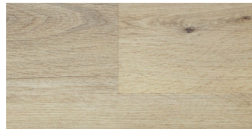
Tarill Oak RET003