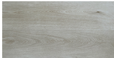
Dorrigo Oak RET002