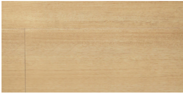
Blonde Tasmanian Oak RET005