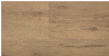
Inger Oak RET009