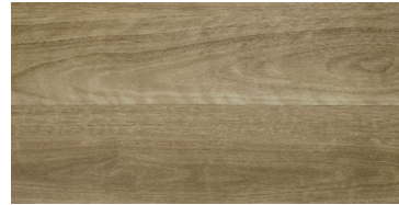
Mirima Spotted Gum RET007