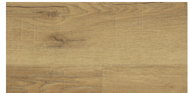
Avar Oak RET004