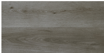
Nambung Oak RET001