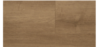
Malin Oak RET008