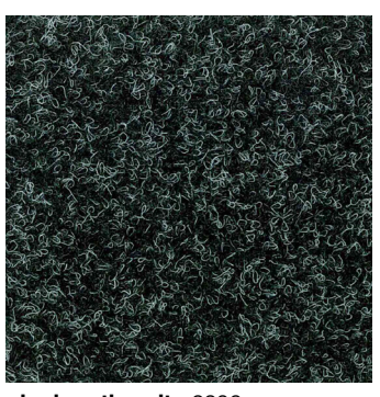
pop dark grey 2081