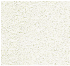
palette magnolia 633