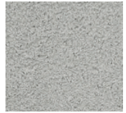
palette gardenia 692