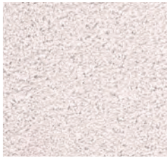
palette camellia 663