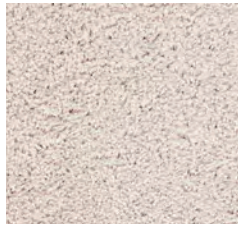
palette tamora 664