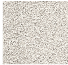
palette honeysuckle 634