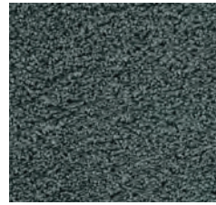
palette foxfern 698