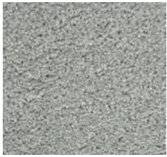
palette brunia 693