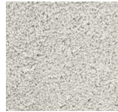
palette acorn 639