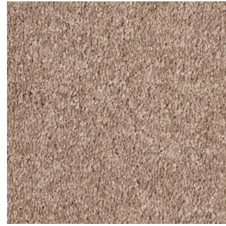
ALISA030 - Relaxation