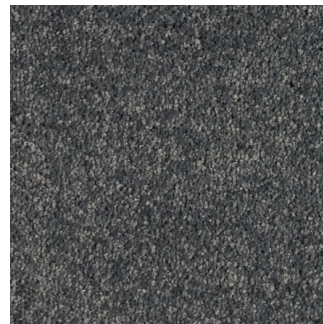
ALISA070 - Pleasant