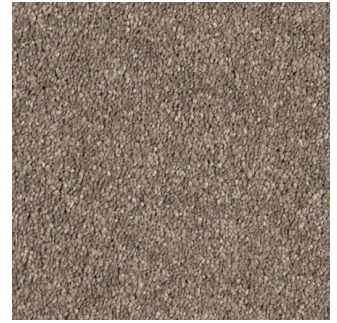
ALISA040 - Content