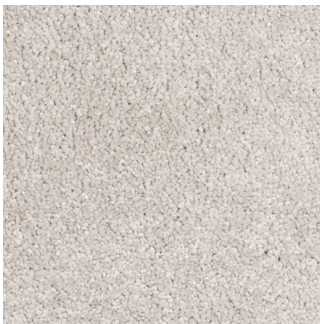
ALISA050 - Delight