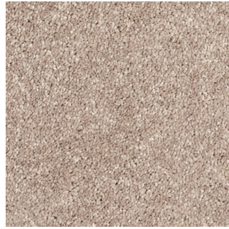
ALISA020 - Cosiness