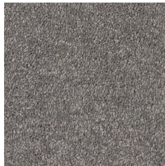
ALISA060 - Satisfaction