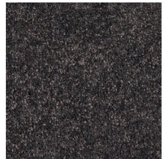
ALISA080 - Enjoyment