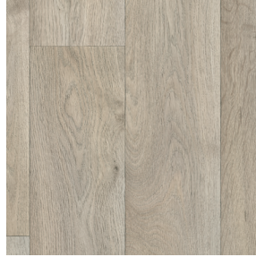
Ontario VTX10126506 Pattern Repeat L100 x W100 Drop 1/2