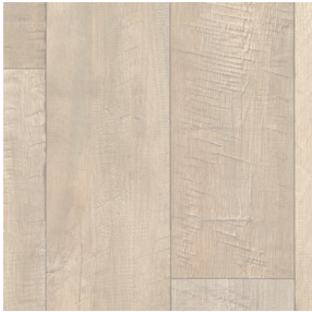
Forster VTX18928837 Pattern Repeat L100 x W100 Drop 1/2