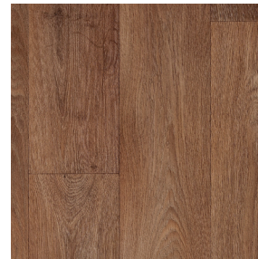
Ontario VTX10126547 Pattern Repeat L100 x W100 Drop 1/2