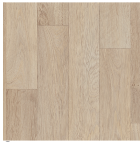
Camargue VTX16826504 Pattern Repeat L120 x W100 Drop 1/2