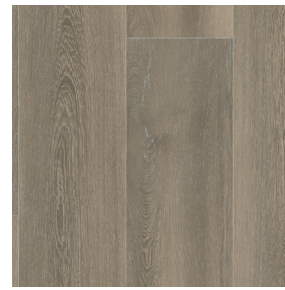
Hatari VTX12126793 Pattern Repeat L120 x W100 Drop 2/5