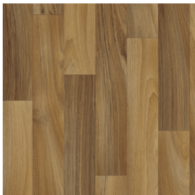
Cordoba VTX1126743 Pattern Repeat L100 x W100 Drop 1/2