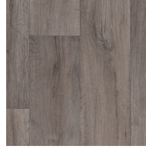
Tundra VTX20126594 Pattern Repeat L120 x W99.5 Drop 5/6