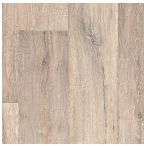
Tundra VTX20126509 Pattern Repeat L120 x W99.5 Drop 5/6