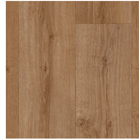
Classic Oak VTX19426857 Pattern Repeat L150 x W200 Drop 1/2