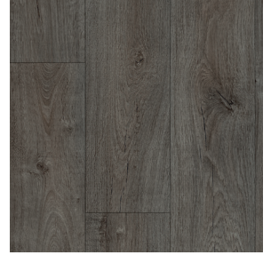
Helsinki VTX19126594 Pattern Repeat L120 x W99.5 Drop 1/2