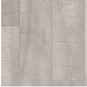
Forster VTX18928895 Pattern Repeat L100 x W100 Drop 1/2