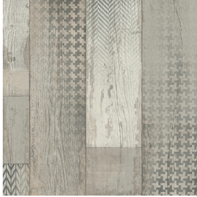
Cabana VTX19026592 Pattern Repeat L120 x W99.5 Drop 1/2