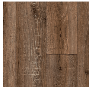
Sorbonne VTX15126548 Pattern Repeat L120 x W99.5 Drop 1/2