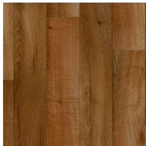
Burgos VTX7726744 Pattern Repeat L100 x W99.5 Drop 2/5