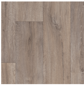
Tundra VTX20126533 Pattern Repeat L120 x W99.5 Drop 5/6