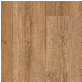
Classic Oak VTX199426835 Pattern Repeat L150 x W200 Drop 1/2