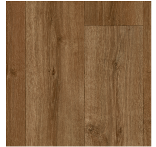
Classic Oak VTX19426839 Pattern Repeat L150 x W200 Drop 1/2