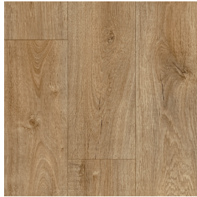
Helsinki VTX19126557 Pattern Repeat L120 x W99.5 Drop 1/2