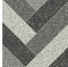
Veneziana VTX20726597 Pattern Repeat L100 x W199 Drop 1/2