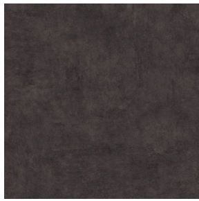
Odin VTX17026596 Pattern Repeat L100 x W99.5 Drop 1/2 Reverse Lay