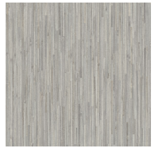
Wander VTX20828592 Pattern Repeat L100 x W99.5 Drop 1/2