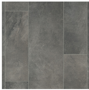
Minos VTX15728596 Pattern Repeat L100 x W100 Drop 1/2