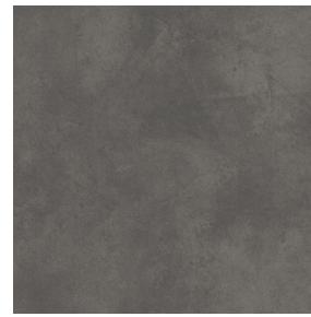
Bari VTX20028594 Pattern Repeat L100 x W100 Drop 1/2 Reverse Lay