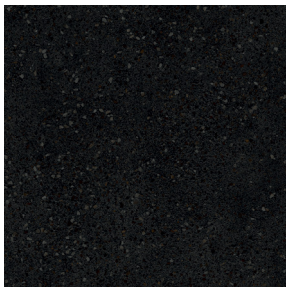
Sorrento VTX20526599 Pattern Repeat L100 x W99.5 Drop 1/2 Reverse Lay