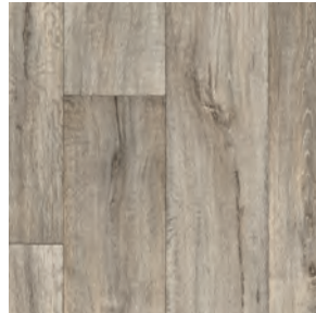
tundra VST20120592 Pattern Repeat L120 x W99.5 Drop 5/6