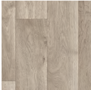
toronto VST10120507 Pattern Repeat L100 x W100 Drop 1/2