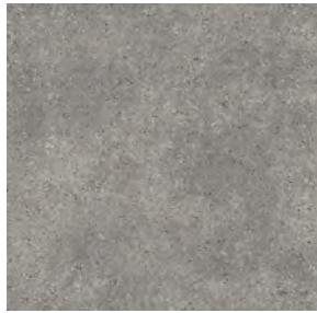
puno VST11820594 Pattern Repeat L100 x W100 Drop 1/2 Reverse Lay