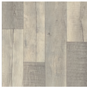
outback VST11720582 Pattern Repeat L150 x W99.5 Drop 1/2