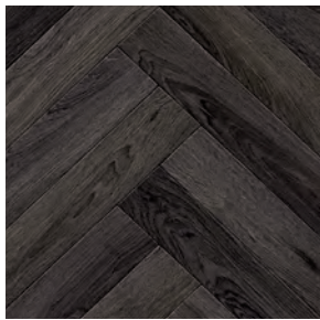
marilyn VST11620599 Pattern Repeat L100 x W199 Drop 1/2