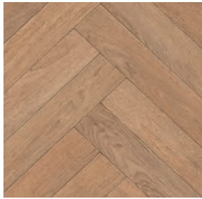
marilyn VST11620537 Pattern Repeat L100 x W199 Drop 1/2