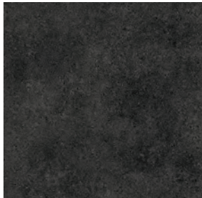
puno VST11820598 Pattern Repeat L100 x W100 Drop 1/2 Reverse Lay