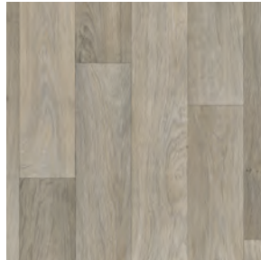
camargue VST16820593 Pattern Repeat L120 x W100 Drop 1/2