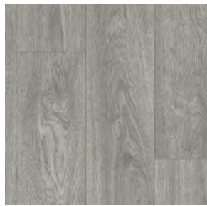
allure VST11920591 Pattern Repeat L120 x W99.5 Drop 2/3