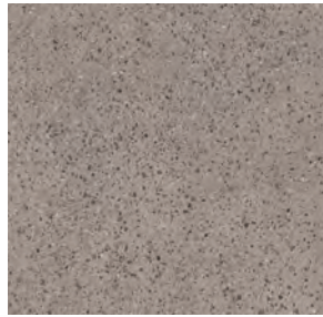
galibier VST20520583 Pattern Repeat L100 x W99.5 Drop 1/2 Reverse Lay