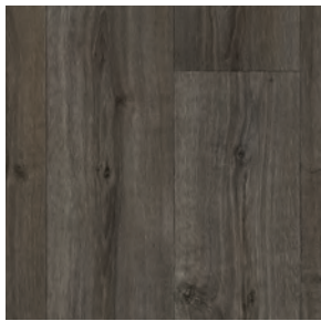
rioja VST19420596 Pattern Repeat L150 x W200 Drop 1/2