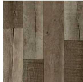
outback VST11720546 Pattern Repeat L150 x W99.5 Drop 1/2