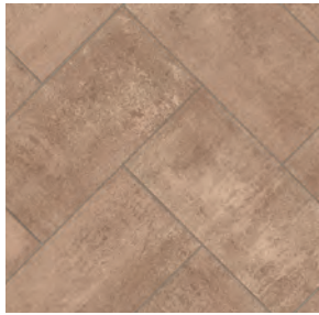
bilbao VST11520538 Pattern Repeat L100 x W99.5 Drop 1/2