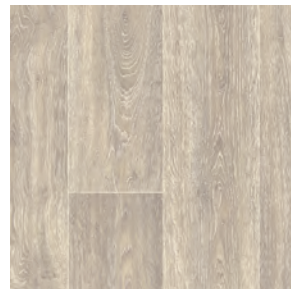
chaparral oak VST19320509 Pattern Repeat L100 x W99.5 Drop 1/2