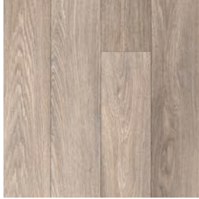
nimes V10918593 Pattern Repeat L100 x W99.5 Drop 1