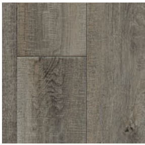
cartier V17718596 Pattern Repeat L150 x W199.5 Drop 1/2