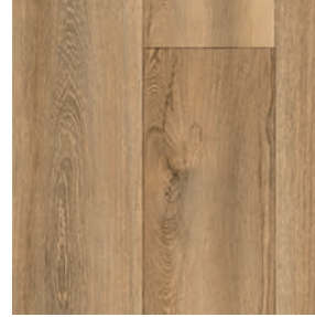
hatari V12118732 Pattern Repeat L120 x W100 Drop 2/5