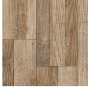
scent wood V11318536 Pattern Repeat L150 x W99.5 Drop 1/2