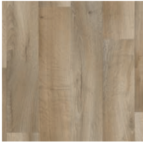
burgos V7718731 Pattern Repeat L100 x W99.5 Drop 2/5