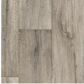
tundra V20118592 Pattern Repeat L120 x W99.5 Drop 5/6