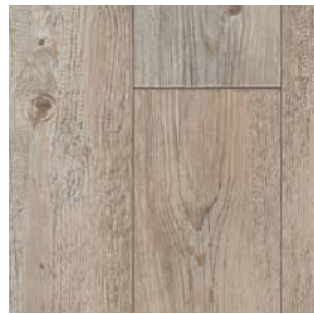
cousteau V17818591 Pattern Repeat L150 x W99.5 Drop 1/2