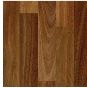
spotted gum V12017065 Pattern Repeat L100 x W100 Drop 1/2