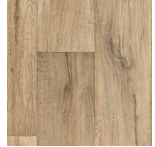
tundra V20118532 Pattern Repeat L120 x W99.5 Drop 5/6