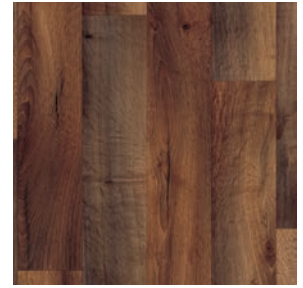
burgos V7718748 Pattern Repeat L100 x W99.5 Drop 2/5