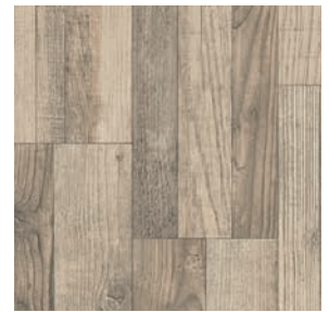
scent wood V11318592 Pattern Repeat L150 x W99.5 Drop 1/2