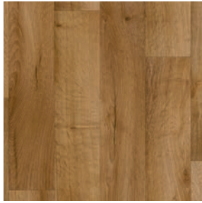
burgos V7718733 Pattern Repeat L100 x W99.5 Drop 2/5