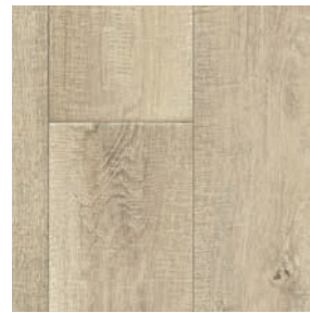
cartier V17718531 Pattern Repeat L150 x W199 Drop 1/2