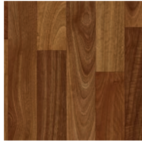
spotted gum V12017043 Pattern Repeat L100 x W100 Drop 1/2