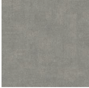
scripto VC13330594 Pattern Repeat L100 x W99.5