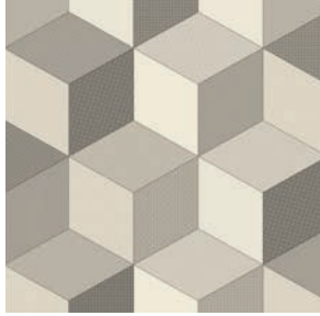
cubes VC13428083 Pattern Repeat L100 x W99.5 Drop 1/3