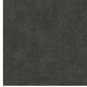
scripto VC13330599 Pattern Repeat L100 x W99.5