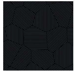
orbit VC13930099 Pattern Repeat L100 x W99.5