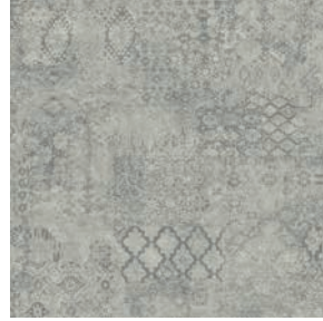
mystique VC14130092 Pattern Repeat L100 x W100