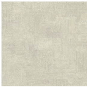
scripto VC13330508 Pattern Repeat L100 x W99.5