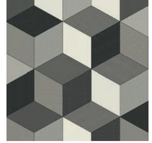
cubes VC13428097 Pattern Repeat L100 x W99.5 Drop 1/3