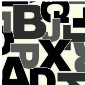
alphabet VC13828094 Pattern Repeat L100 x W99.5