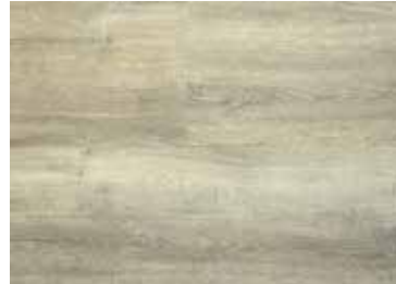
Hyde Oak SUM4914SP