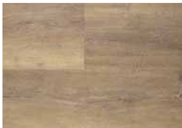
Park Oak SUM4918SP