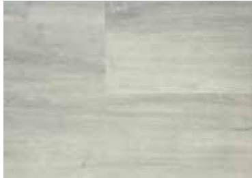
Paronella Oak SUM4912SP