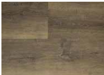
Royal Oak SUM4915SP