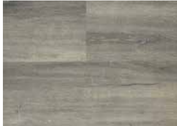
Kings Oak SUM4911SP