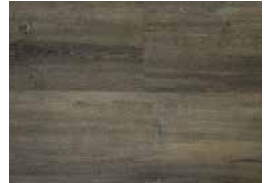
Fitzroy Oak SUM4917SP