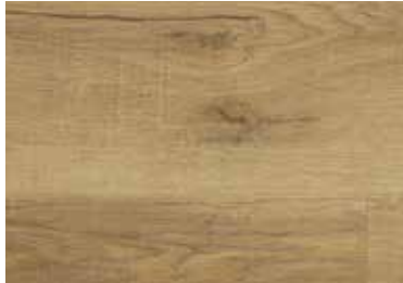
Avar Oak RET057SP

WATER PROOF FAMILY PROOF FADE RESISTANT HEAT RESISTANT