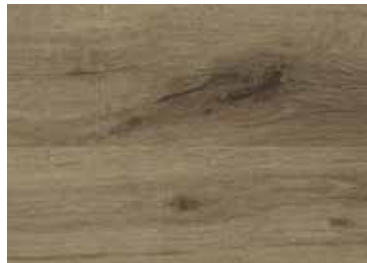
Espen Oak RET060SP