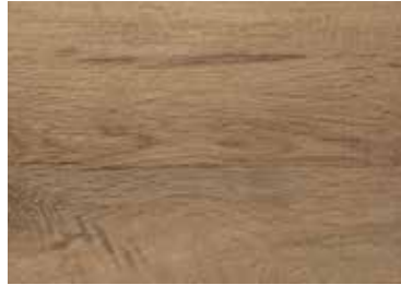
Inger Oak RET058SP