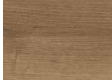
Malin Oak RET1773SP