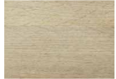
Tarill Oak RET1770SP