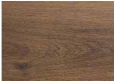
Gunvar Oak RET1774SP