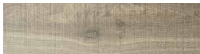
WHITSUNDAYS1144 Hayman Oak