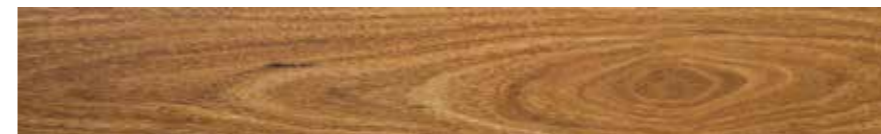
PENINSULA1161 Dromana Spotted Gum