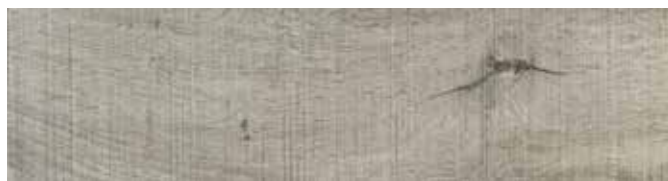
WHITSUNDAYS1140 Hamilton Oak