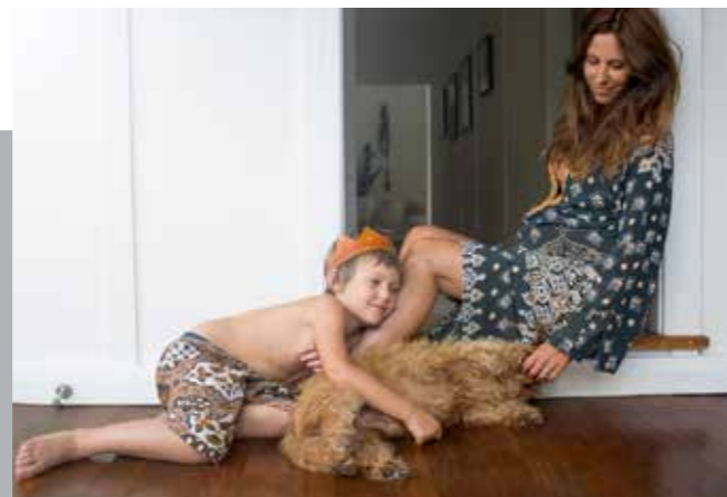
Jacana Spotted Gum

AquaPlank™ is extra hard wearing Clear, enhanced UV cured coating - scratch resistant - stain resistant - burn resistant - anti-bacterial