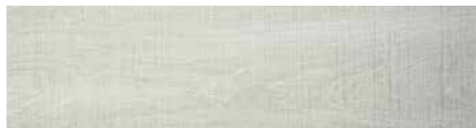
WHITSUNDAYS1146 Whitehaven Oak