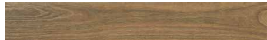
PENINSULA1160 Portsea Spotted Gum