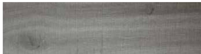
WHITSUNDAYS1148 Lindeman Oak