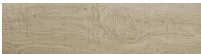
WHITSUNDAYS1143 Long Island Oak