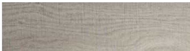
WHITSUNDAYS1145 Airlie Oak