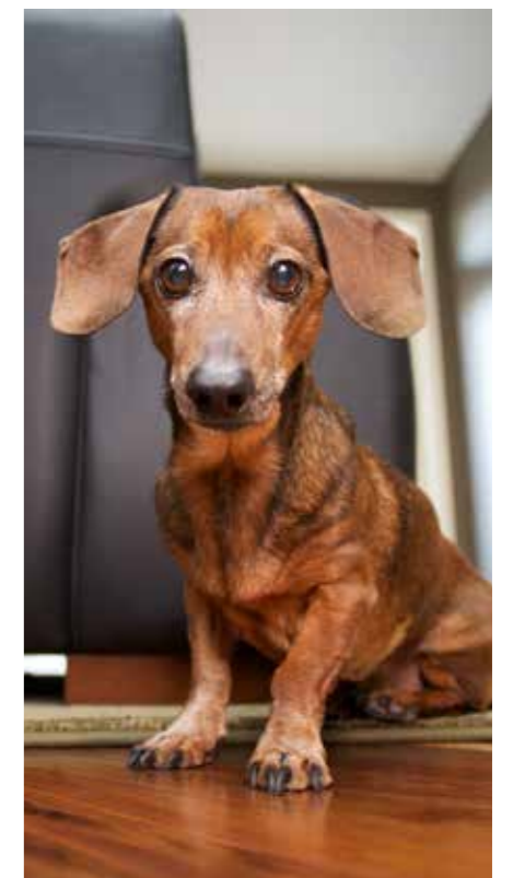
Dromana Spotted Gum