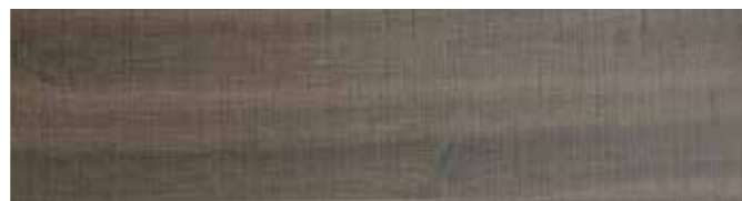
WHITSUNDAYS1141 Brampton Oak