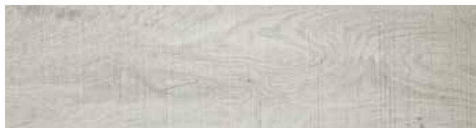
WHITSUNDAYS1147 Daydream Oak