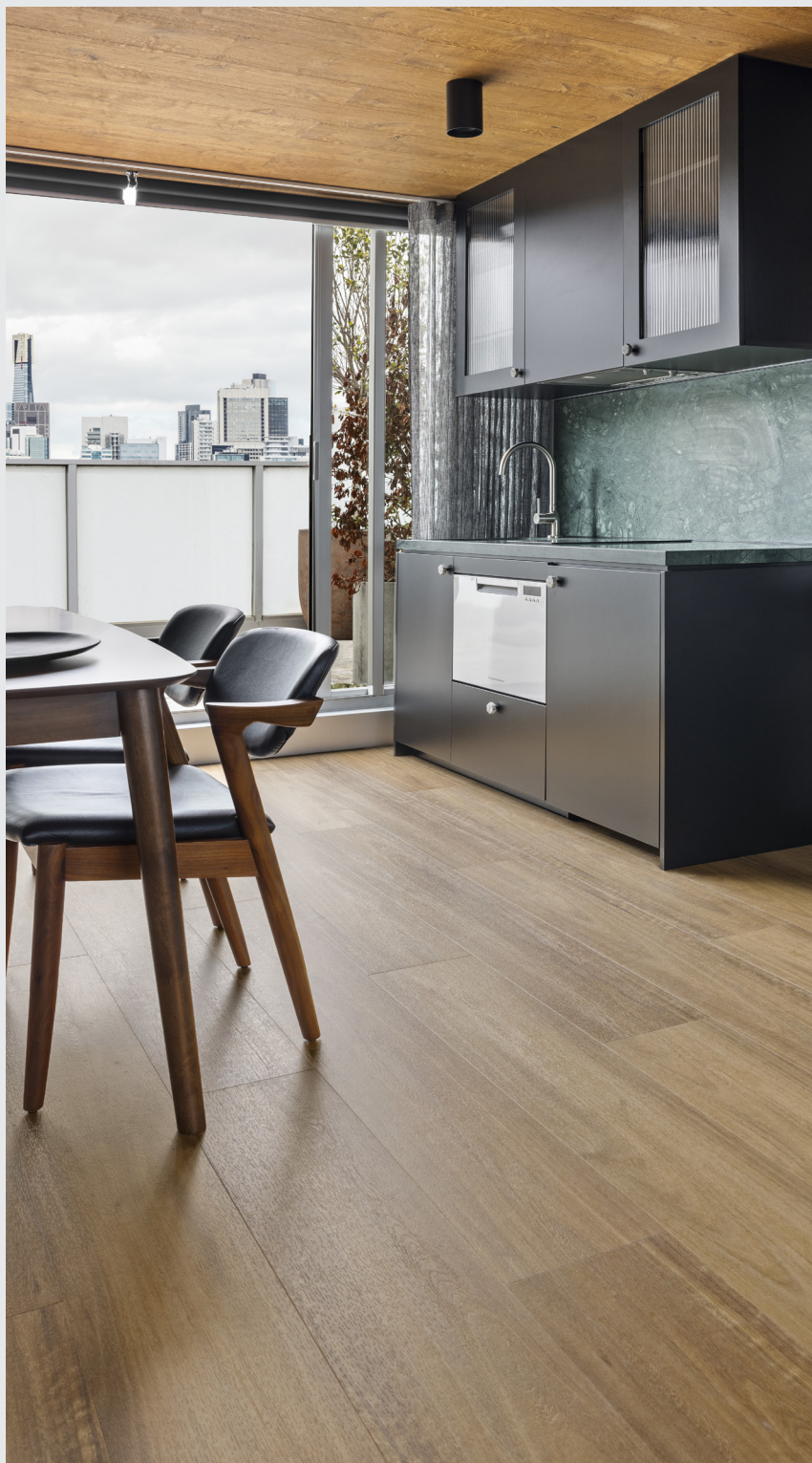
BROWN STRINGYBARK ACOUSTICWOOD04HY

au 1800 150 554 nz 0800 150 555 signaturefloors.com.au signaturefloors.co.nz