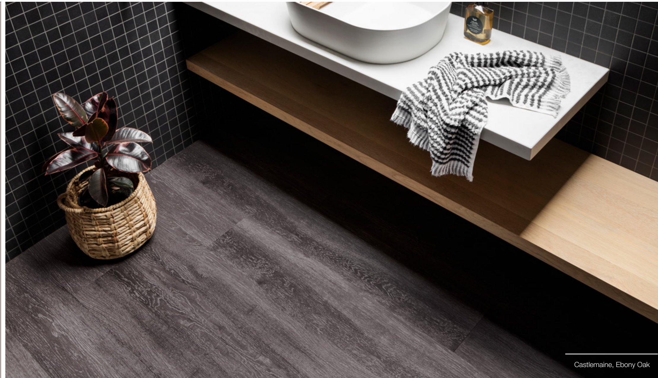
Castlemaine, Ebony Oak

These NCC requirements do not apply to Office, Education, Hospitality and other commercial buildings.