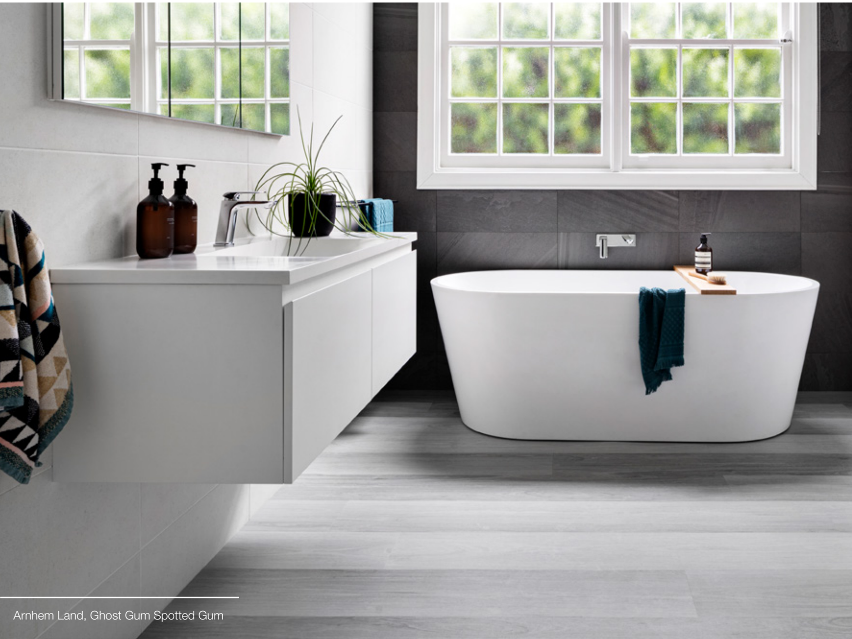
Arnhem Land, Ghost Gum Spotted Gum