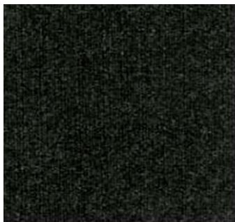
dark harbor 2210