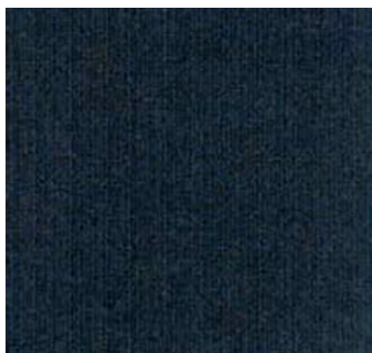
high seas 5109