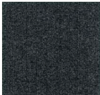
strong winds 5078