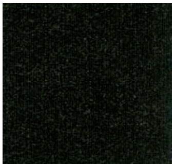
ocean channel 2127