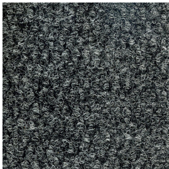
pop dark grey 2081