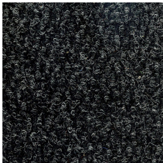
pop anthracite 2236