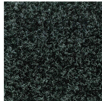
plush anthracite 2236

product construction yarn/fibre pile weight total thickness width roll length