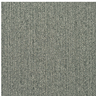
trail slate 300