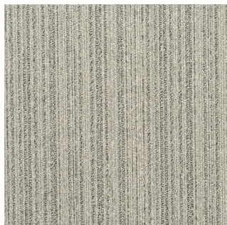
trail pebble 400