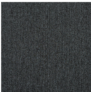
trail rock 100