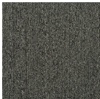
trail granite 200