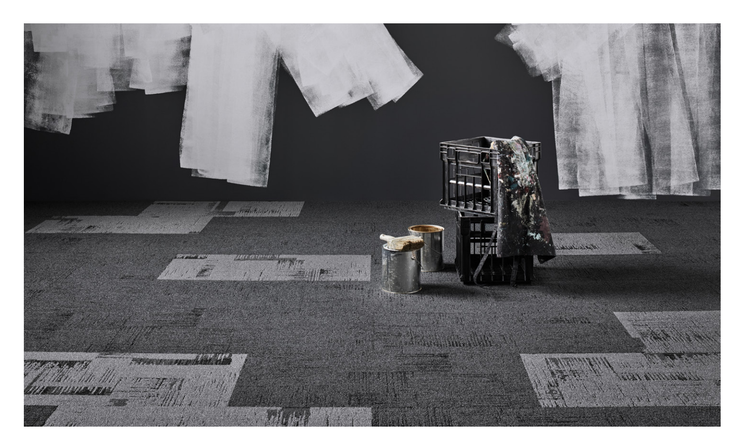
A STATEMENT OF ARTISTIC EXPRESSION