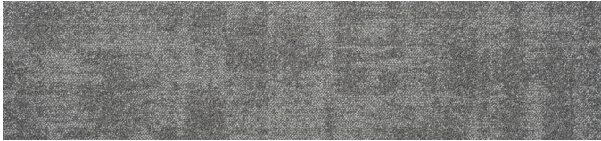
gravel cement 300