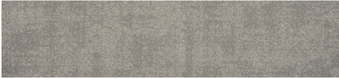
gravel stone 400