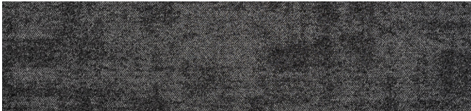
gravel ash 200