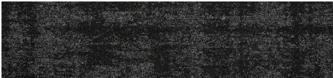
gravel coal 100