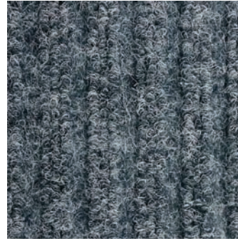
sea spray 5085