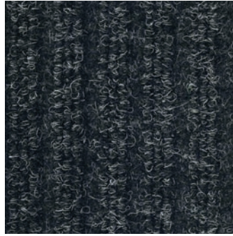
coral reef 2236