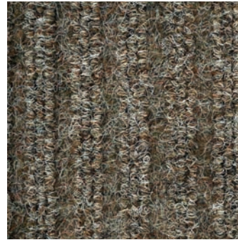
pebble beach 7011