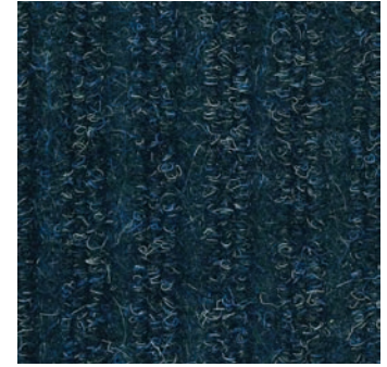
blue ocean 5018