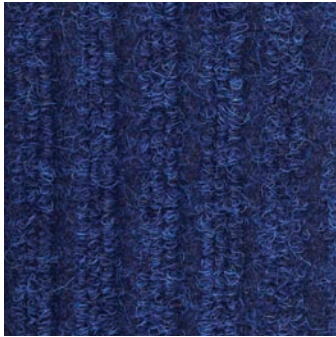
deep sea 5038