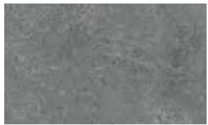
perlato stone :: 46968