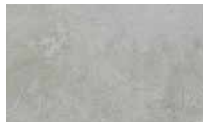
washed stone :: 46942