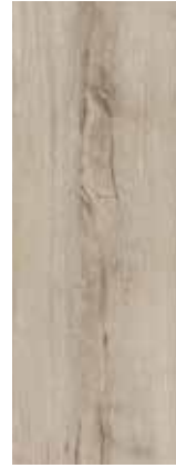
mountain oak 56215