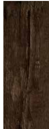
french oak 4892