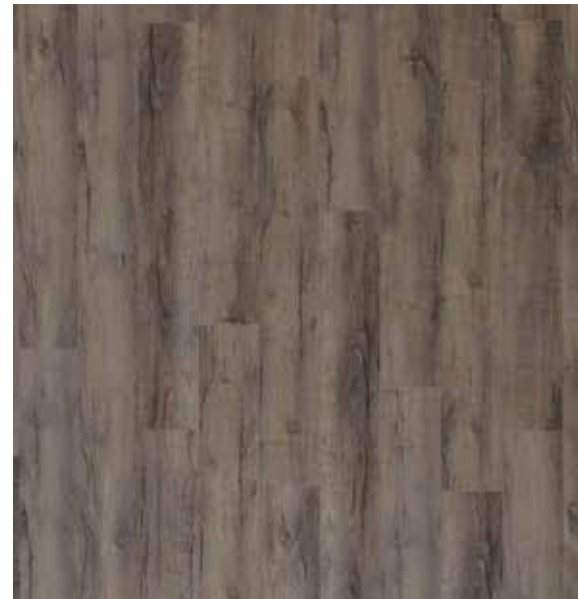
MOUNTAIN OAK 56870 IMPRESS