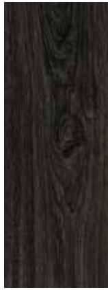
verdon oak 24984