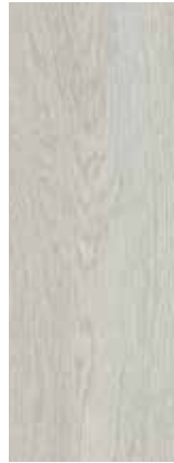
sovereign oak 22110