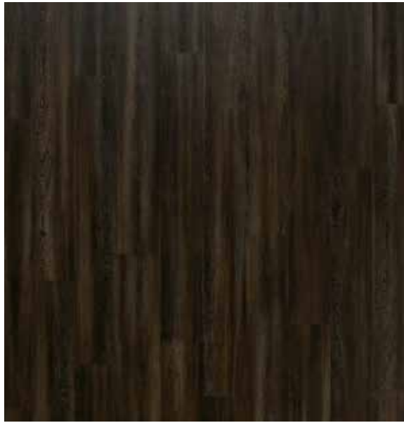
ETHNIC WENGE 28890 TRANSFORM