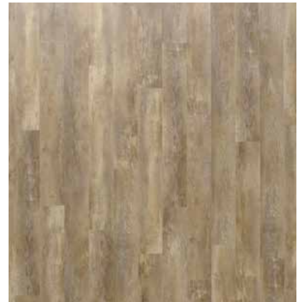
FRENCH OAK 4842 INSPIRE