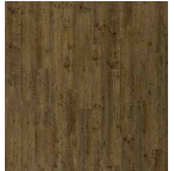
OXFORD OAK 24854 INSPIRE