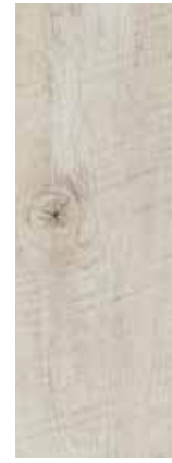
castle oak 55152