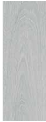
verdon oak 24117