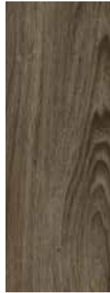
sovereign oak 22863