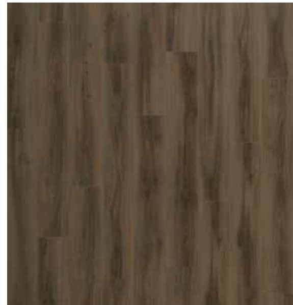
CAMBRIDGE OAK 24877 INSPIRE