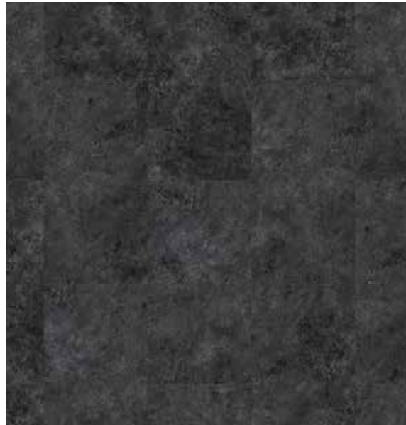
PERLATO STONE 46972 ULTIMATE