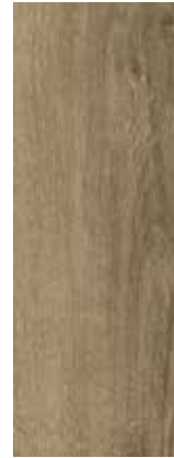
summer oak 24244