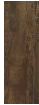
country oak 54880