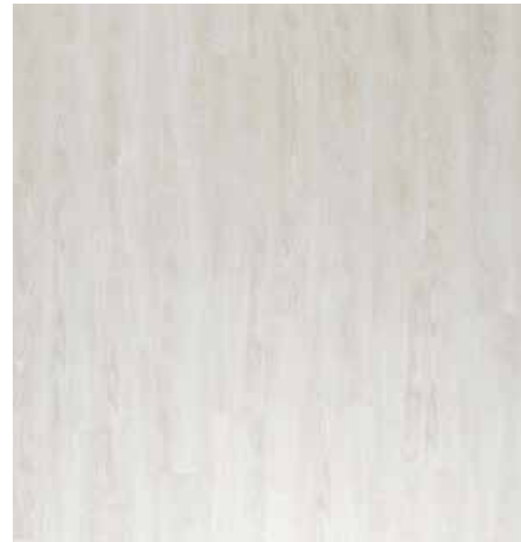
SOVEREIGN OAK 22110 INSPIRE