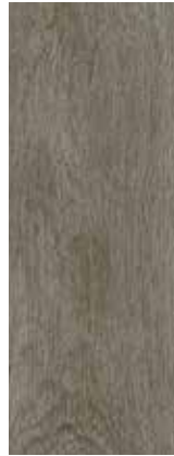
sovereign oak 22231