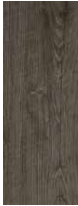
latin pine 24868