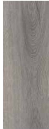
summer oak 24933