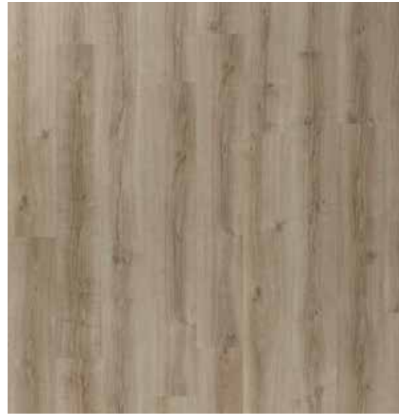
ULTIMO OAK 24219 TRANSFORM