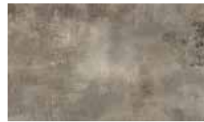
dorato stone :: 40862