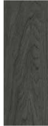
casablanca oak 24983