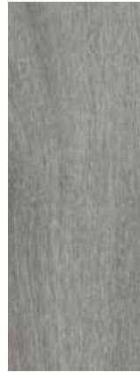
sovereign oak 22929