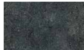
jurastone :: 46975