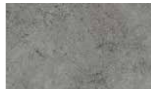
jurastone :: 46960