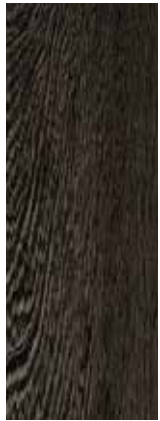
ethnic wenge 28890