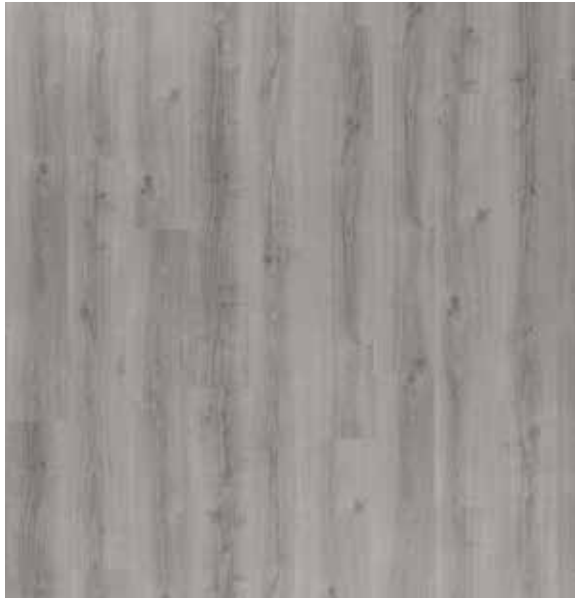
SUMMER OAK 24933 ULTIMATE