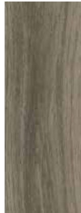
cambridge oak 4864