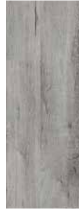
mountain oak 56938