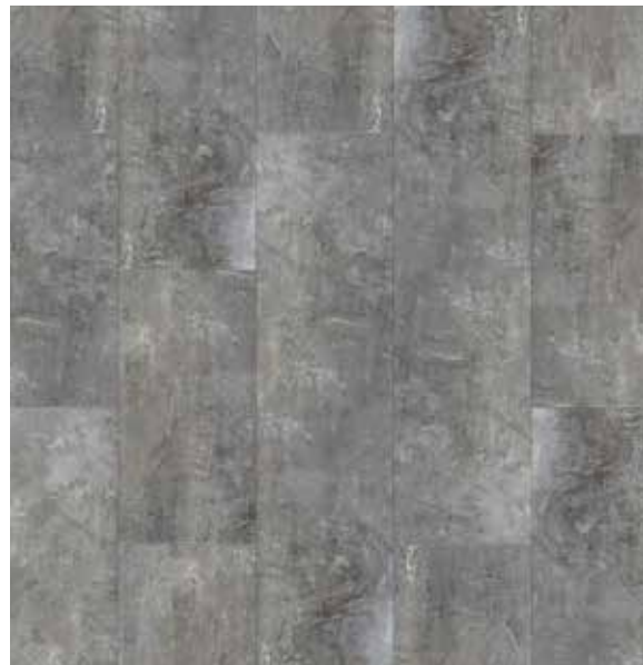
WASHED STONE 46982 INSPIRE