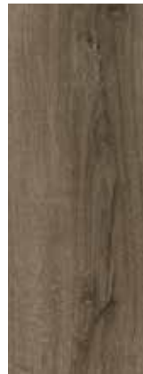
ultimo oak 24867