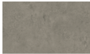
perlato stone :: 46950