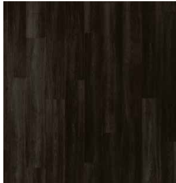
VERDON OAK 24984 TRANSFORM