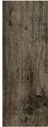
oxford oak 24854