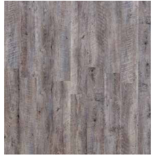
CASTLE OAK 55960 IMPRESS