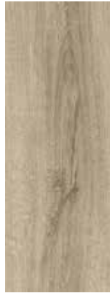
summer oak 24219