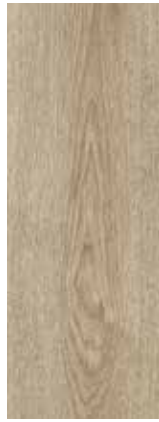
verdon oak 24280