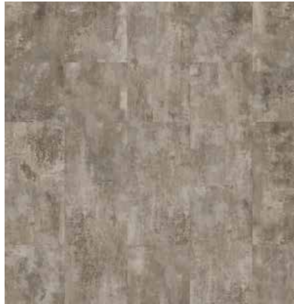
DORATO STONE 40862 ULTIMATE