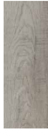
country oak 54925