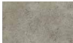
jurastone :: 46840