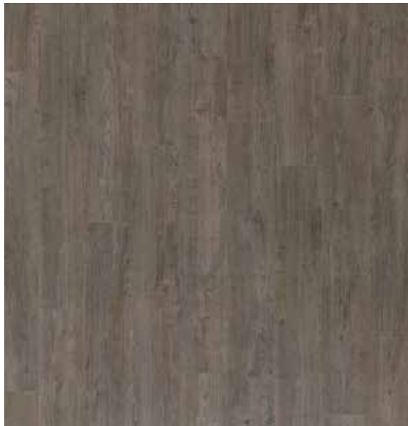
LATIN PINE 24868 TRANSFORM