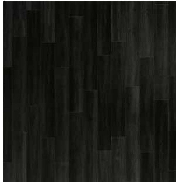
CASABLANCA OAK 24983 ULTIMATE