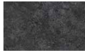
perlato stone :: 46972