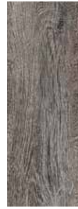
castle oak 55960