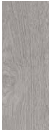
verdon oak 24232