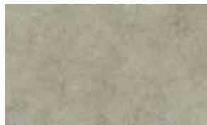
jurastone :: 46935