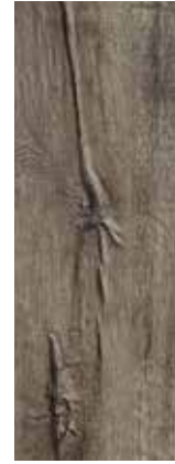
mountain oak 56870