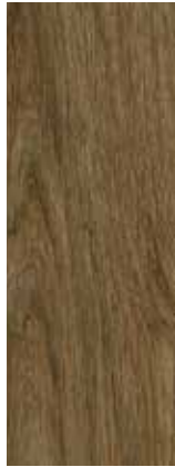
sovereign oak 22821