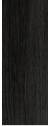
casablanca oak 24890