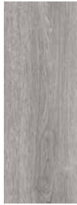
verdon oak 24936