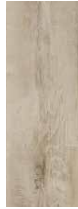
country oak 54225