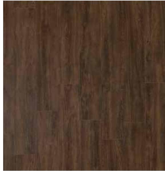
MONTREAL OAK 24570 TRANSFORM