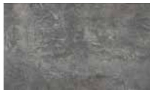
washed stone :: 46982