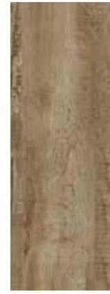
country oak 54852