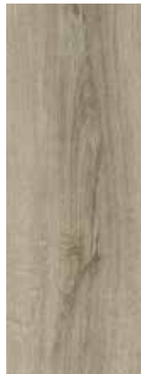
ultimo oak 24219