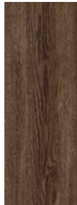
montreal oak 24570