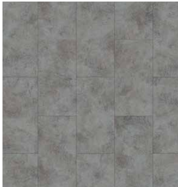
JURASTONE 46960 TRANSFORM