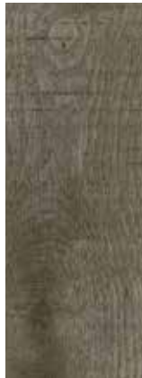
french oak 4842