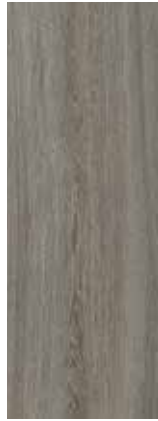
ethnic wenge 28282