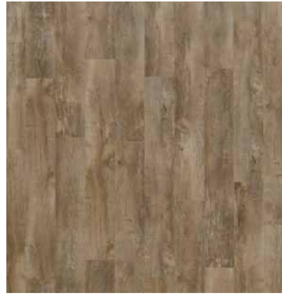
COUNTRY OAK 54852 IMPRESS