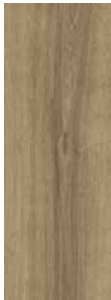
ultimo oak 24244