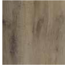
hadley oak 539