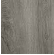
zane oak 2359

product plank size total thickness wear layer wear layer treatment installation method