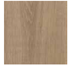
avery oak 1858