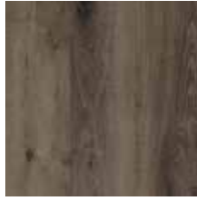
perla oak 540