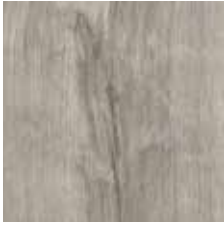
grayson oak 1860