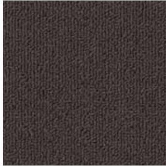
fox tail 4002