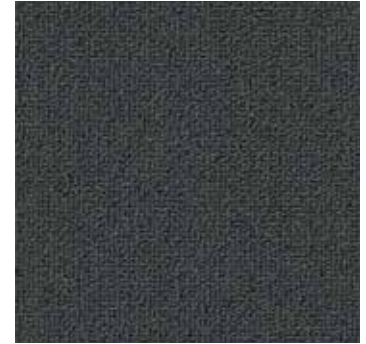
stone chip 4001