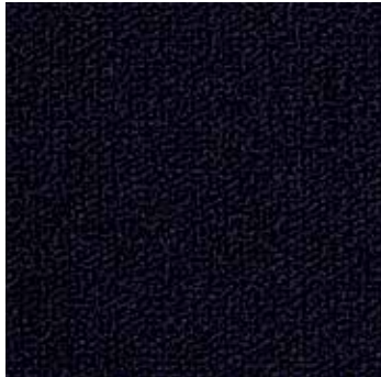
musk ox 3094