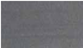
MOSS goose 9897