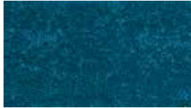
MOSS teal 2131