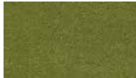
MOSS green 0244