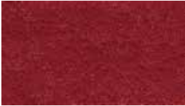
MOSS red 3586