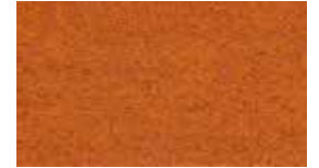
MOSS orange 5324