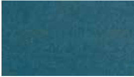
MOSS aqua 3193