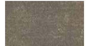
MOSS tan 0507

product construction yarn/fibre pile weight pile height gauge plank size total thickness carton size total weight dimensional stability backing electrostatic propensity