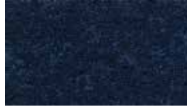
MOSS navy 6740