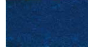
MOSS blue 3704