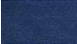
MOSS sea 3936