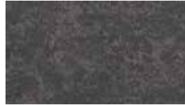
MOSS wolf 0098