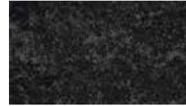
MOSS henna 1675