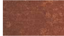
MOSS duck 5456