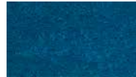
MOSS sky 7352