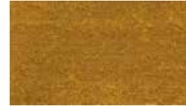
MOSS yellow 4282