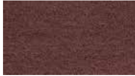
MOSS wine 8561