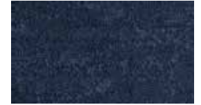
MOSS whale 7112