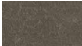
MOSS caramel 0905