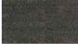
MOSS smokey 7578